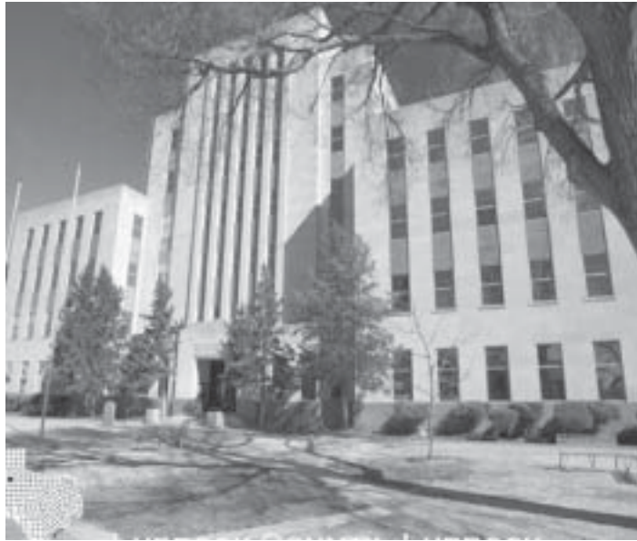
Lubbock County Courthouse - built in 1950 of limestone and granite at a cost of $1,250,000