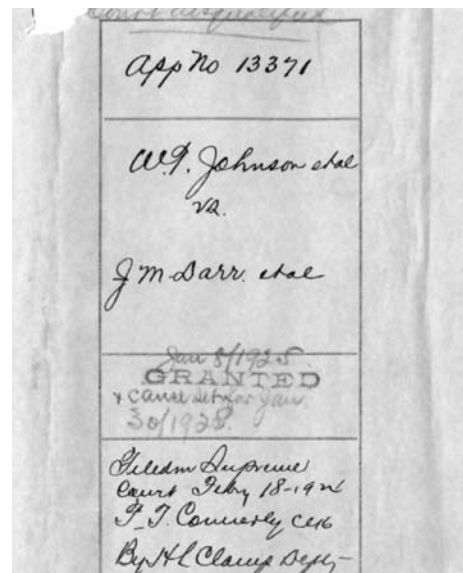
Photo of the Johnson v. Darr case file at the Texas Supreme Court

Photo of original court records